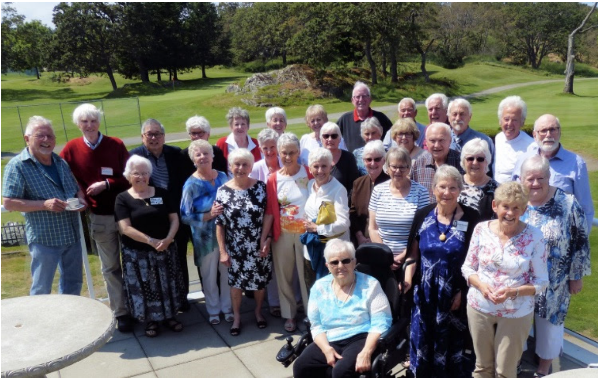
The class of '59 on deck of Cedar Hill Golf Club – 60 years and more of friendships.