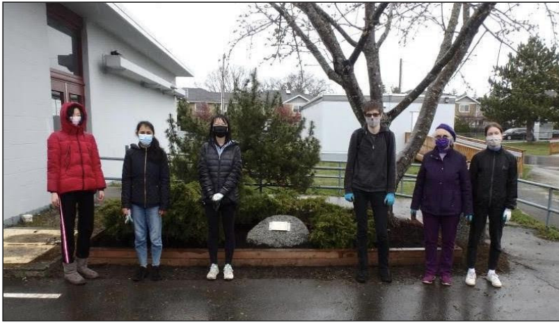
The finished up garden